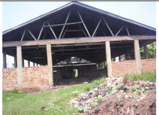
The shell house for waste composting at Seeta