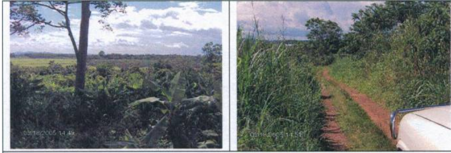
Above: part of the site for the proposed landfill, and the road to Kati Fish Landing site on lake Victoria shores