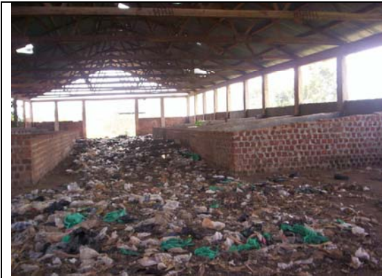
Inside the waste composting house: sorted waste and waste composting units

collection of peelings, no notice was made of other persons/entities involved in waste management.