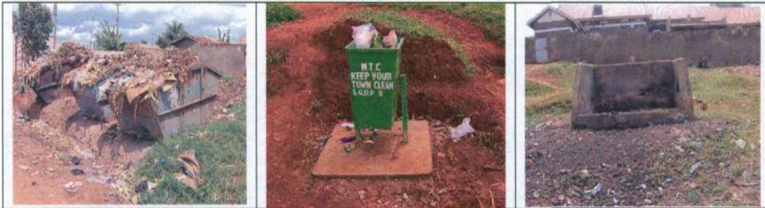
Above: waste collected infrastructure in MTC including waste skips at transfer station, waste bin, and garbage bunker.

Upto 16 persons are involved in waste collection, but the budget of 60 million remains limiting. The fuel requirement per week is 876l of diesel. Waste collection is yet to be privatised, but the TC is promoting private – public partnership in waste management. This will be backed up a bye- law in advanced stages of development.